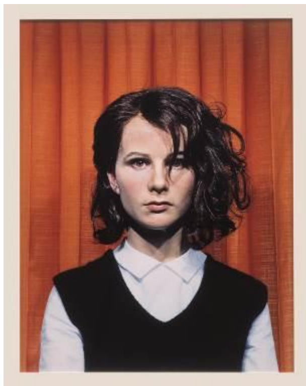
Self Portrait at 17 Years Old , 2003 C-Print 115,5 x 92 cm Fundación 'La Caixa' Collection, Barcelona