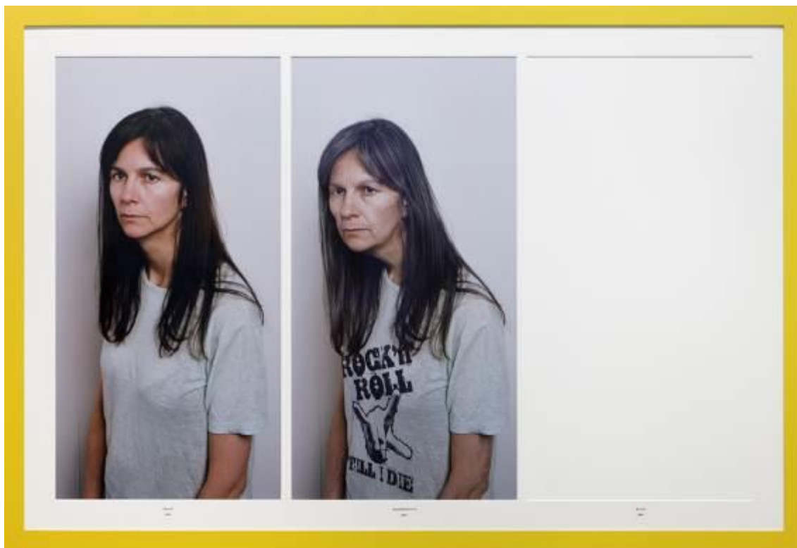
Rock 'n' Roll 70, 2015 C-Print 131 x 192 cm

Gillian Wearing's first solo exhibition in Spain since 2001 will be opened at the IVAM on September 24. Most of the works included have been created by the 1997 Turner Prize winner over the past 15 years. The British artist (Birmingham, 1963) will attend the opening in Valencia. Photographs like Rock 'n' Roll 70 or the video installation entitled Your Views are the newest works that will be on show.