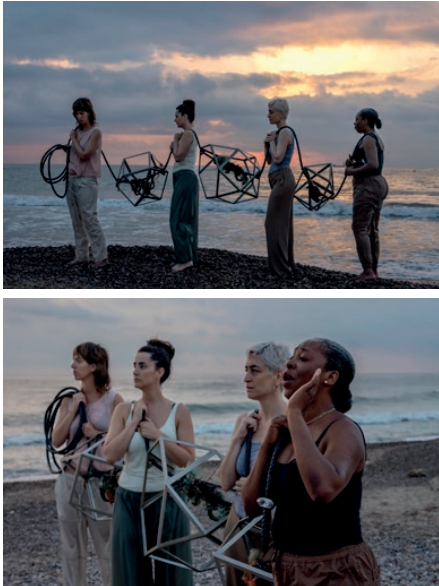
Performance Constellation to Appease , El Saler beach, Valencia, 2023

and the rubber-coated industrial rope reflects the significance of rope in Cornish industrial shipping. Nkanga has generated an iteration of this performance in the Mediterranean Sea for the exhibition in Valencia.