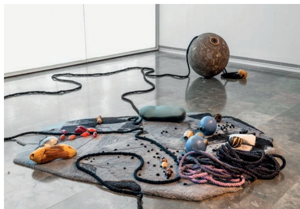
Leaving Trails in the Distance , 2021.

Nkanga originally created Carved to Flow for documenta 14, an international exposition that took place in Athens, Greece, and Kassel, Germany, in 2017. For this project, Nkanga held a soapmaking workshop in Athens, where prototypes were created using water, charcoal, lye, and seven butters and oils from the Mediterranean, the Middle East, and North and West Africa. Nkanga explains the symbolism: "One of the things that connects all these spaces is oil. We could think of the oil underneath the sea or soil, or trees and plants ... what connects, not what divides, and to think about how people