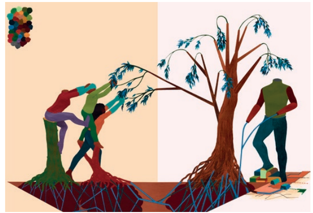
Whose Crisis Is This? , 2013.

Parallel narratives form the central theme of Nkanga's monumental tapestry Double Plot (2018). The tapestry incorporates different perspectives and talks about acts that have affected land and the lives of people. The background depicts the structure of the solar system and star formations. From a bird's-eye view, a network of lines is reminiscent of land measurements and borders, of structural divisions that create tensions. The frontal perspective shows a man without a head and hands, next to a tree holding a chord to the network of discs on the next layer. This plane zooms into photographic images of explosions and riots – moments of manifestation of power and moments where people are manipulated and controlled by power structures – such as the uprising at Tahrir Square, which is documented here and aligns with the star constellation in the background from that very day. As such, the man invites you to look up, down and forward in order to discover the double narratives and connections. The textile work also opens up a temporality, like the light of the stars shot into the universe long before