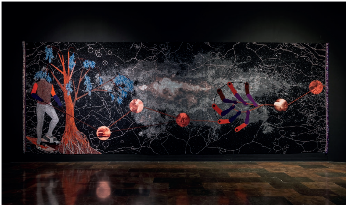
Double Plot , 2018.

their twinkling reaches our eyes, or the politically oppressive situations playing out in parallel globally. Situations and appearances that happened at a certain time and are rendered visible at another. The depicted elements of bodies, land, and plants are literally woven together and connected and remind us that political decisions have human, geological and social repercussions.