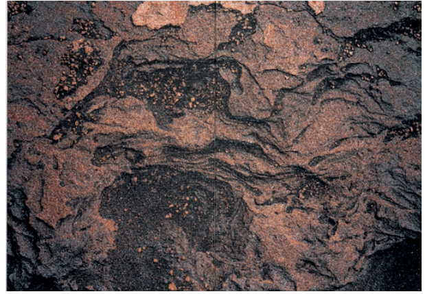
Steel to Rust - Meltdown , 2016. Courtesy of the artist

with an area devastated by mining in Namibia known as 'Green Hill', which, since 1875, has seen its mineral-rich soil hollowed out, leaving a scar in the landscape. Solid Maneuvers , a poeticized translation of Green Hill's inverted, excavated topography – containing vermiculite, salt, make up, heavy mineral sands and shredded copper – serves as a poignant reminder of the ecological implications of capitalist accumulation. The gravel and the mica of the installation form a slag-like landscape. The sculptural elements resemble islands or archipelago landscapes and are made up of different materials which have been layered to create the varying formations. The title Solid Maneuvers refers to the fact that it is the body that maneuvers, transforms, and manipulates the raw materials we extract from nature. Natural landscapes are constantly being transformed or exploited according to what they can provide us with. Integrating performance into the work, Nkanga considers how the machinery used for mining these landscapes are informed by the physical gestures of the human body. Two hanging works, Steel to Rust – Meltdown (2016) and The Rift (2023) allude to social, economic and industrial corrosion and its physical and emotional repercussions for the human body and the environment.