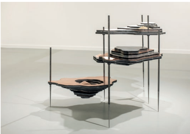
Solid Maneuvers , 2015.

In the last room Otobong Nkanga's presentation centres around the installation Solid Maneuvers (2015), a manifestation of her encounters