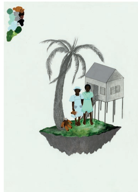
Home 1977, Yaba, Lagos, 2010 , from the series Filtered Memories 1977–1981 . Collection Harm and Floor Haak (The Netherlands)

Social Consequences (2009–2014) is a series which, together with Filtered Memories (2009–2010) and Captured Gestures (2016), provide insight into Nkanga's worldview and her rendition of memories. The drawings explore labor, household, home, and concepts such as belonging and ownership. The artworks have a surrealistic air and present both recognizable and violent objects such as weapons and projectiles, but also social gatherings and domestic situations. A distinctive feature of Nkanga's art is how she puts together diagrammatic motifs, often using part of the image as a palette and including this in