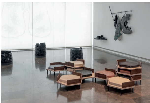
Carved to Flow , 2017.

Charred, so I had to breathe In the absence of oxygen Scarred, so I had to leave These lands of bare ash residues Fleeing, breathing