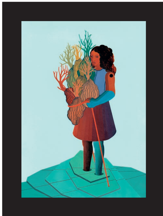
The Harvest , 2022, from the series Social Consequences V .

Press Dossier Institut Valencià d'Art Modern