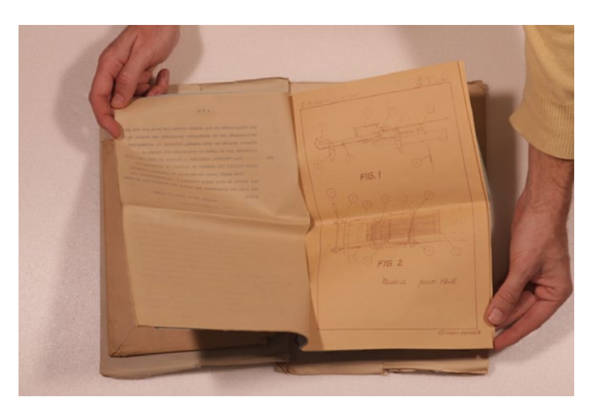
Plan of machinery.