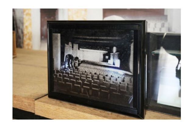
Photograph of a tile worker in Onda. Museu del Taulell "Manolo Safont", Onda.

Photograph of men and women workers at the Juan Martí factory, in the exhibition "Imatges del Passat" ("Images of the Past") at the Museu del Taulell "Manolo Safont", Onda.