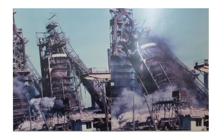
Blast furnaces of Sagunto. "Gerència Pública ya!" campaign, Puerto de Sagunto. CC.OO, Camp de Morvedre

with the last of these, Industry explores proposals for institutions organised from within civil society, together with certain processes of transformation of factory spaces into self-managed social centres. Devices of interdependence will include materials related to forms of organisation, such as those of the Gerencia Pública initiative to convert the old residential complex and remains of industrial buildings in Puerto de Sagunto into citizens' infrastructures; the proposal of the 1990s to turn Alcoi into an open-air industrial museum; La Corporación, a project that exemplifies the popular struggle to save the industrial warehouses of La Cros; and other movements in defence of the heritage.