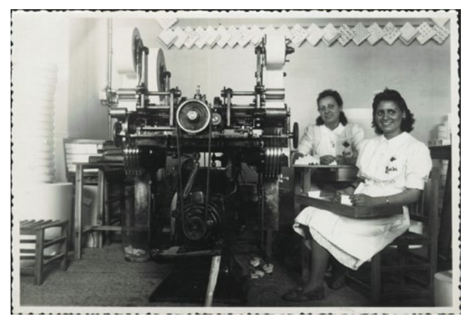
Women workers at the El Bambú factory, Alcoi.