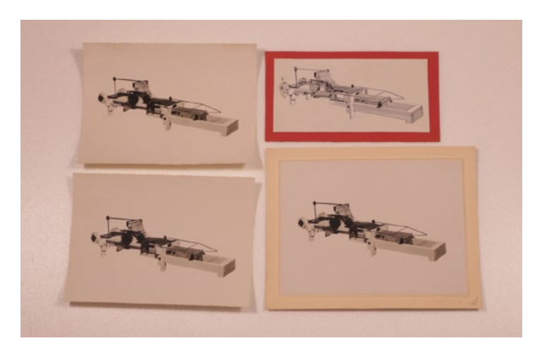
Photographs from a machinery catalogue.