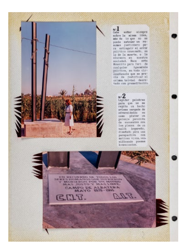
Album on the self-managed commemorative monument of the concentration camp of Albatera. CNT.