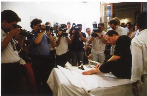
Time Capsule, 1997

Potax (Ivry-sur-Seine, Édition Action Poétique, France / Maribor, Kibla, Slovenia 2007). His anthology Signs of Life: Bio Art and Beyond (MIT Press, Cambridge, MA 2007) documents the history and theory of bio art, of which Kac is a pioneer. His work is documented on the Web in eight languages: http://www.ekac.org .