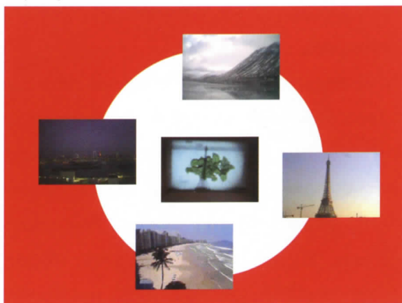
Teleporting an Unknown State, 1994-96