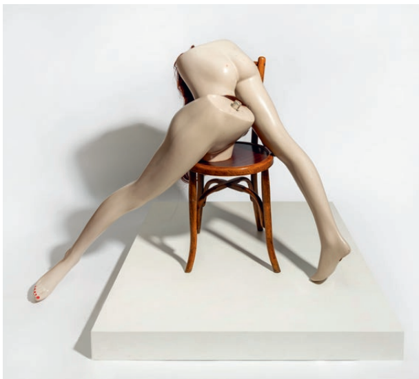
No espero al otro que también soy yo (I do not await the other that is also me), 2021. Artist's Collection