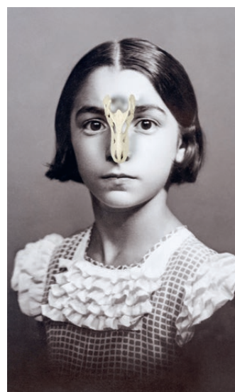
Carta a un profesor (Letter to a teacher), 2018. Artist's Collection

On the basis of photographs retrieved from abandoned albums, Carmen Calvo constructs a sort of memorial in this room to anonymous women, a visual metaphor for the subordination of woman in the past and even in the contemporary societies of today. Faces and bodies are blurred, covered and erased. Eyes and mouths are deprived of their primal function of looking, saying and deciding.