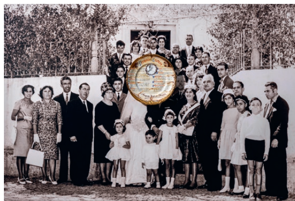
Decálogo de la esposa (The wife's commandments), 2020. Artist's Collection

these fingers acquire a menacing appearance, as they resemble the jaws of carnivorous plants with piercing spikes evocative of punishment.