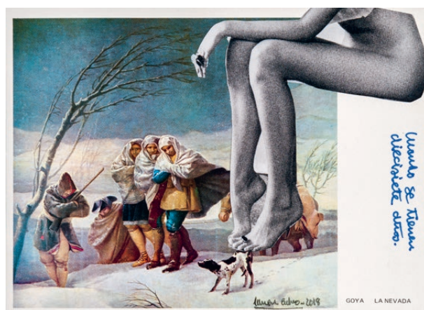
Cuando se tienen diecisiete años (When one is seventeen years old), 2018. Artist's Collection

The same process of abrasion and intersecting meanings acts in the series of books intervened by the artist. The methodical coldness of accounting ledgers or the solemnity of the literary or philosophical discourses that have sought their refuge in old books are subjected to the insertion of small objects that unleash ironic new interpretations in the viewer's gaze.