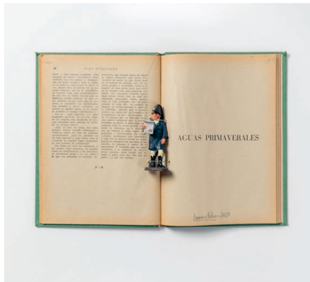
El mensajero (The Messenger), 2020. Artist's Collection

Like the poet Paul Éluard, Carmen Calvo is fascinated by postcards. On these images printed on cardboard, she incrusts fragments of photographs and enigmatic handwritten phrases in a