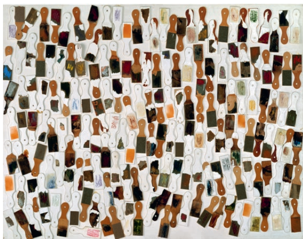
Serie Recopilación-Reconstrucción (Compilation-Reconstruction Series), 1977 Azcona's Collection

Made in plaster and stone, the work Silencio I y II ( Te prometo el infierno ) (Silence I and II [I Promise You Hell], 1995) occupies a prominent place in this exhibition as it is one of the artist's first incursions in the field of the installation. Dozens of white slabs are piled on a wall from which hundreds of threatening daggers are hung, bearing reminiscences of cemeteries and tragic events and the memory of absence.