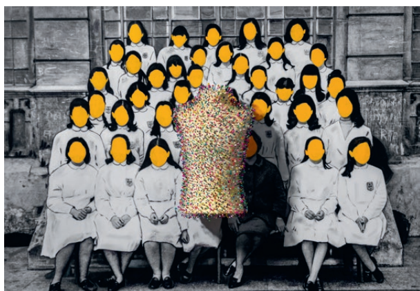
Queridas mías (My dears), 2020. Artist's Collection

Like a scene taken from a dream, a large cabin – the installation La naturaleza agita (Nature Stirs, 2010-2018) – houses hundreds of terracotta fingers that protrude from its walls. They are women's fingers. Their invasive and seductive arrangement in the space seems to invoke the stimulation of sexual desire and the charms of earthly pleasures. At the same time,