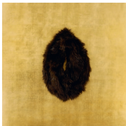
Negro corsé velludo (Hairy black corset), 2002. Artist's Collection

During the months of confinement owing to the COVID pandemic, the artist used those long days of solitude and seclusion to rewatch many of the films of the classic American cinema and the Nouvelle Vague that have stimulated the development of her creative imaginary. With the camera of her mobile phone, Carmen Calvo captured fragments of those films, images of scenes and faces that remained caught and petrified by the click of the device. Assembled and projected in a dark room, these diffuse stills resemble a phantasmagoria, a claustrophobic narrative on the sense of uneasiness caused by the situation of isolation.