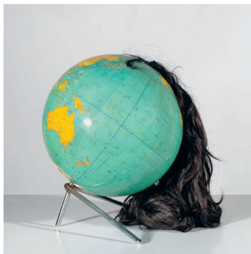
Et pourlèche la face ronde (maquette), 2013 Artist's Collection

In Carmen Calvo's imaginary, hair is a symbol of woman's identity, of her sexuality, and of the punishments to which she has been subjected over the centuries. In the disturbing works Negro corsé velludo (Hairy Black Corset) and Sexo en la cara (Sex in the Face), hair is