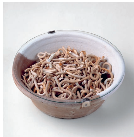
Recopilación naturalezas (Nature compilation), 1988. Artist's Collection

Groups of invented plaster objects share a location with real objects rescued from the rubbish tips of History: a taxonomic repertoire arranged on showcase-tables now converted into a sort of sample display of ironmongery where the remnants of old imaginary ruins are exhibited.