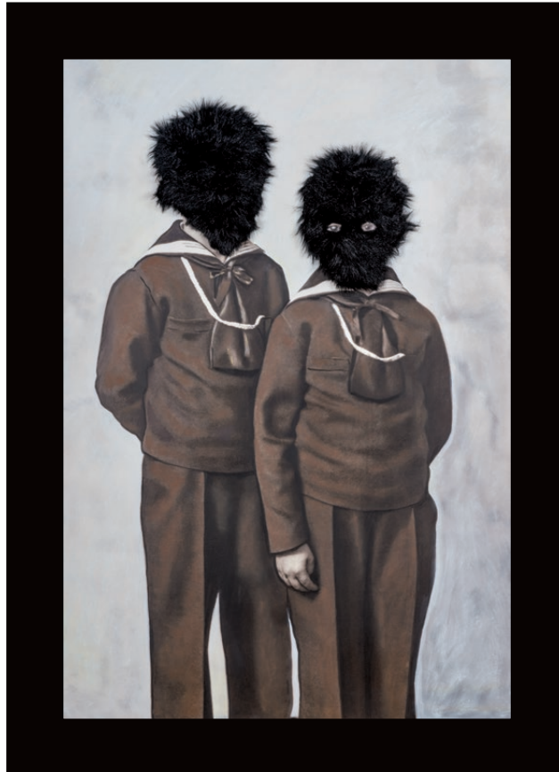
Son ideas sentimentales (They're sentimental ideas), 2015. Artist's Collection

Press Dossier IVAM Centre Julio González