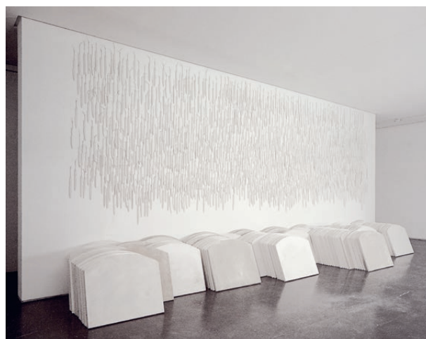
Silencio I y II (Silence I and II), 1995 Museo Nacional Centro de Arte Reina Sofía