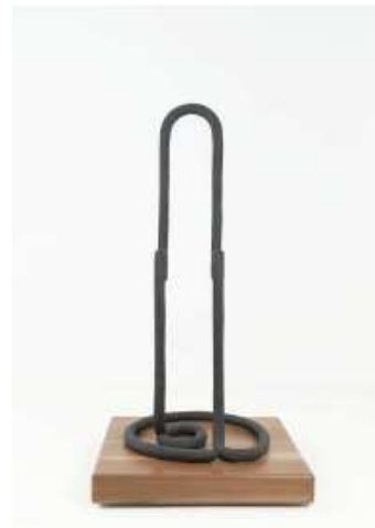
One , 2012 Bronze 196 x 74 x 76 cm.